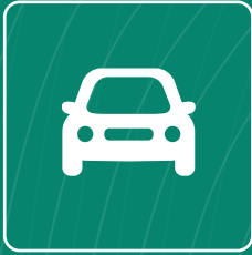
ALLOCATED CAR PARKING