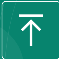
3.55m EAVES HEIGHT 5.48m AT APEX