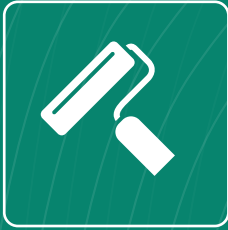
HIGH QUALITY REFURBISHMENT