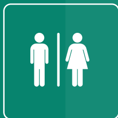
NEW WC FACILITIES