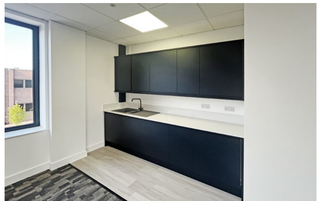
ALL IMAGES: INDICATIVE REFURBISHMENT