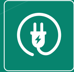
EV CHARGING POINTS