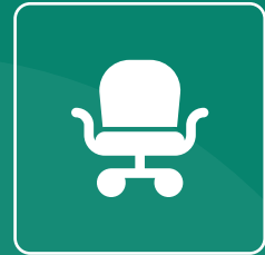
NEW FULLY-FITTED FIRST FLOOR OFFICES