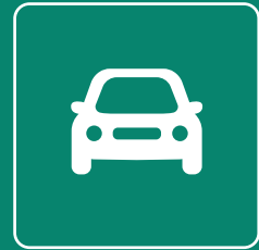
ALLOCATED CAR PARKING