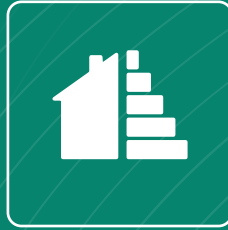
TARGET EPC RATING A