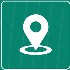
LOCATED AT PARK ENTRANCE