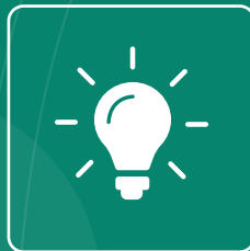
LED LIGHTING TO OFFICES