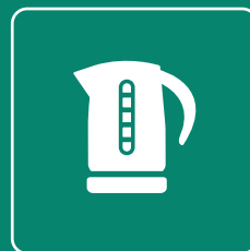
NEW GROUND FLOOR KITCHENETTE