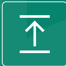
CLEAR INTERNAL HEIGHT 3.15m