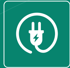
EV CHARGING POINTS